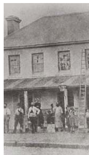
The Jolly Miller Hotel at the southern end of Queen Street