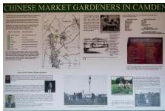
Story board upstairs in the museum