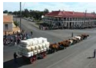
Above: Trundle main street Below: Peak Hill railway station