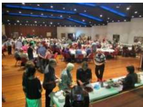
View of the room

Camden Council invited volunteers from the wide ranging groups that benefit the well being of the community.