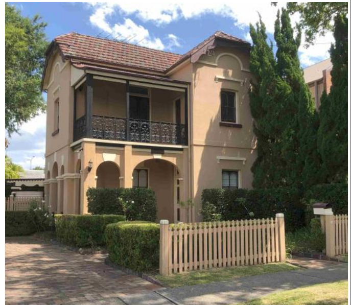
Edithville, 18 Mitchell Street, Camden formerly Camden Cottage Hospital 1899-1902.

Throughout 1899-1902, Camden Cottage Hospital became a cornerstone of local healthcare, earning respect and trust within the community. Its establishment marked a significant step toward modernizing rural healthcare services, laying the groundwork for future medical advancements and community health improvements in the Camden area.