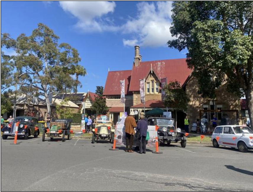
John Street with old cars outside the Alan Baker Art Gallery Macaria