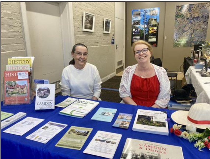
Stalls in the Camden Library function room included Camden Area Family History Society, Camden Historical Society, and Friends of Belgenny Farm